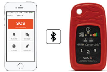
Connected via Bluetooth

GeoCompanion offers both tracking satellite airtime as well as cost effective fallback satellite airtime.